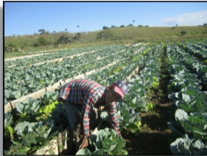
Cabbage crop: Cubans are excellent gardeners!