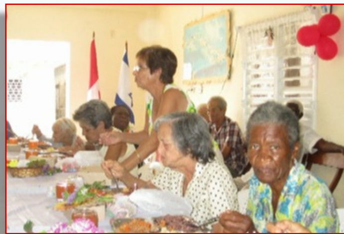
Seniors enjoying a good meal, including vegetables from the project gardens