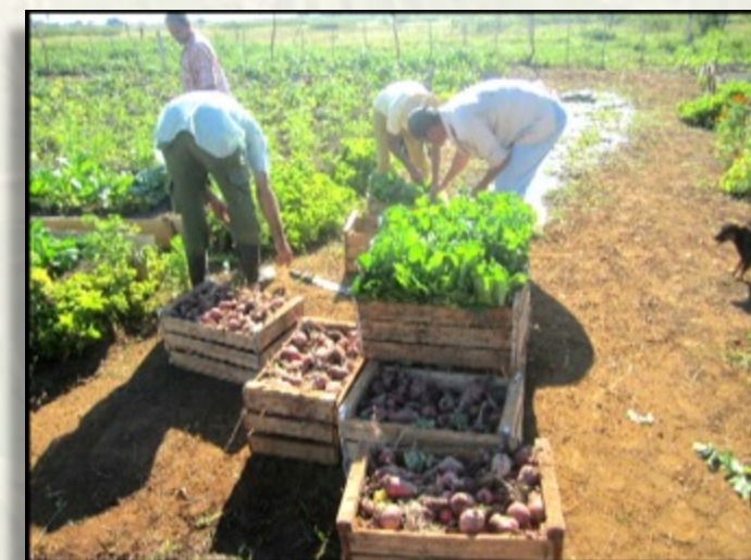
Project families harvesting root crops and other vegetables from their improved and expanded gardens. Some of the produce will be sold on contract with the government and some privately, and a portion will be used to help feed 70 needy senior citizens.

We are so thankful to be able to partner with these believers. We look forward to seeing more good fruit from this program as it grows.