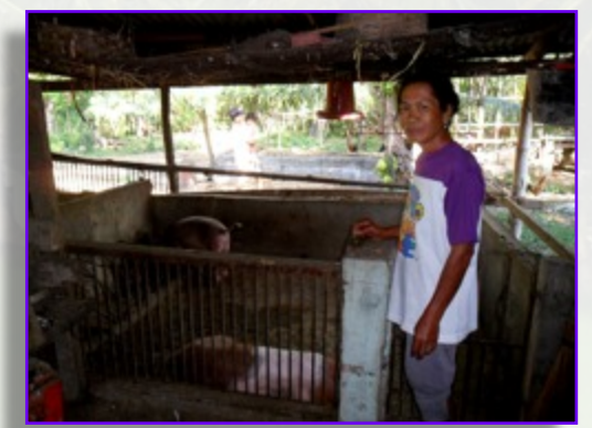
Hog rearing project