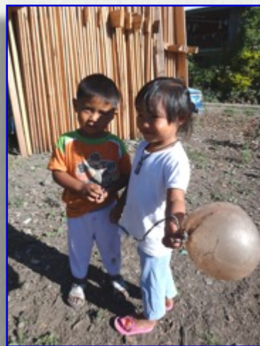
Igorot children with pig bladder balloon!