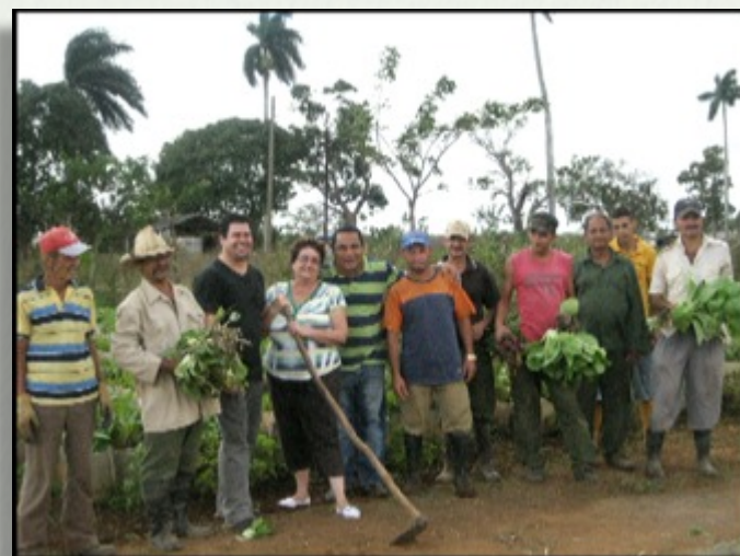
Project holders, senior center staff and oversight group

Please pray for this program and this open door!