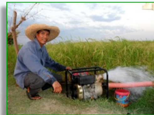
Irrigation has helped increase Vic’s rice crop