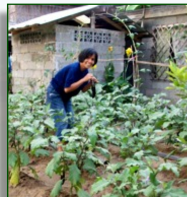
Egg plant project