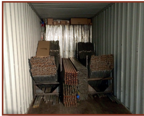
Frames loaded in 40 ft. container