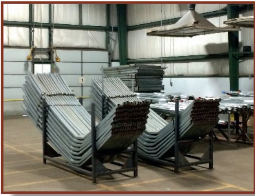
Greenhouse frames prepared for shipping