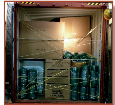
Fully loaded, ready for shipment to Moldova

Luurtsema Sales, Inc. has graciously donated and shipped eighteen greenhouses and "Flip and Grow" pots to our FARMS program in Moldova. These photos show the 40 ft container as it was loaded.