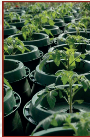
Tomatoes starting out in Flip and Grow pots.