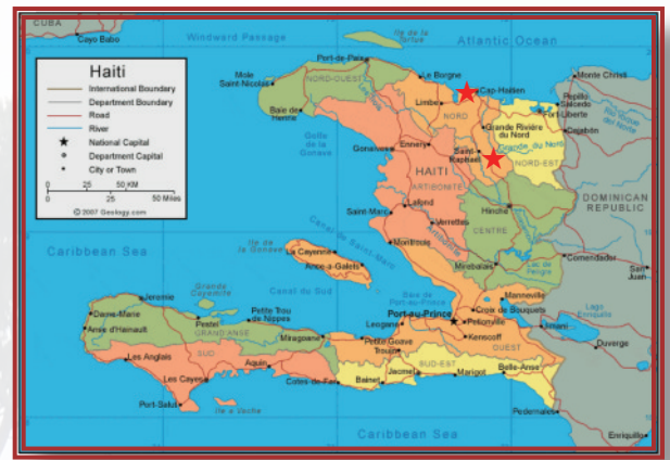
★ Locations of our programs in Haiti

Haiti a land of trials, disasters, sorrows, hardships, droughts and mudslides due to deforestation, earthquakes, hurricanes, floods, corruption, and despair! A place easy to give up on, right? However, we can't give up. Why? Because God has not given up on Haiti, so we won't either! As, "... one member suffers, all the members suffer with it. " 1 Corinthians 12:26