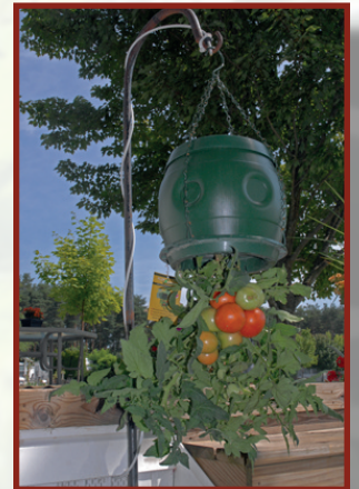
Tomatoes growing after the pots are flipped. Up to 30# of vegetables can be grown with each pot.