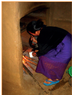
Naga tea time

NONPROFIT ORG US POSTAGE PAID DULUTH, MN PERMIT NO 40