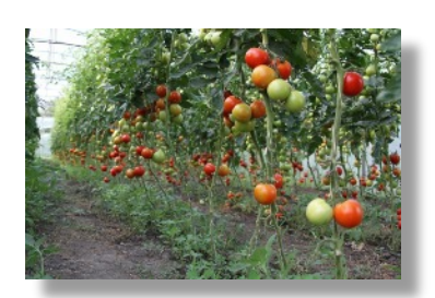
Green house tomato project