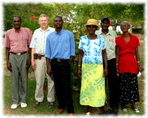
Bohoc FARMS committee, Central Plateau