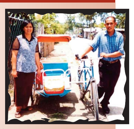
(Continued on next page)

FARMS International, Inc. • P.O. Box 270 • Knife River, MN 55609 • (218) 834-2676 • 1-888-99FARMS E-mail: info@farmsinternational.com • Website: www.farmsinternational.com