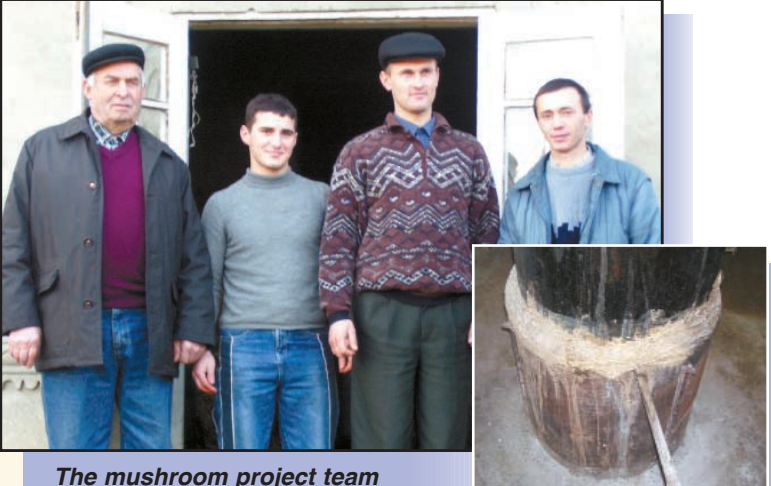
The mushroom project team

$1,000 and transformed it into income and jobs for dozens of people. The project is self sustaining and they have plans to expand. I did not speak their language, but their pride was unmistakable as they explained the process to me in detail.