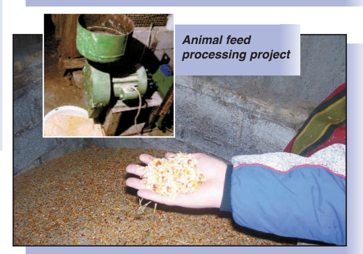
A project supplying farmers with proper animal feed mixes has helped to provide funds to remodel a church plant building.