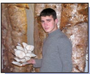
Explaining how they now are growing several mushroom varieties for market

Using plastic garbage bags and straw they were growing very valuable mushrooms for market. They heated the facility with a