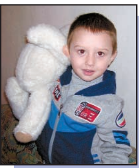
Families can remain intact through our partnership with GMII.

• One is certainly the increased tithing that is allowing pastors to focus on evangelism and sending out missionaries to un-reached villages around Moldova.