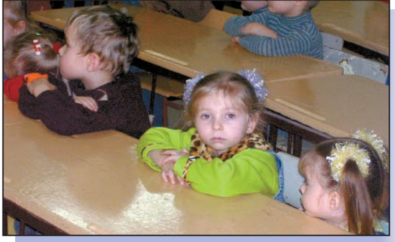
Christmas and New Years are celebrated twice in Moldova

(Photos from Moldova, Continued from page 3)