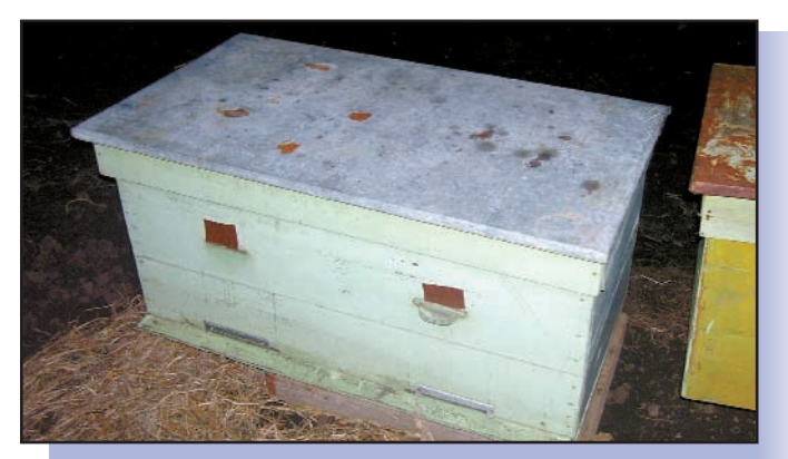
Honey projects provide good income. Honey is a rare commodity at market.

Honey production projects are another very profitable enterprise in Moldova, as most of the economy is agricultural. Honey is a rare commodity with high market value. The project holders, with loans of $500 to $800, are now earning incomes three to five times as much as they had earned previously. This has truly changed their lives and their future.