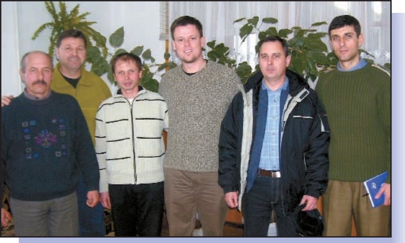
FARMS volunteer loan committee. A second committee is planned for this year.