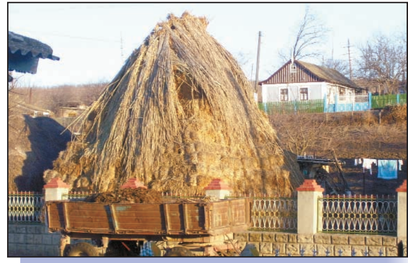
Storing hay in an outdoor "barn"