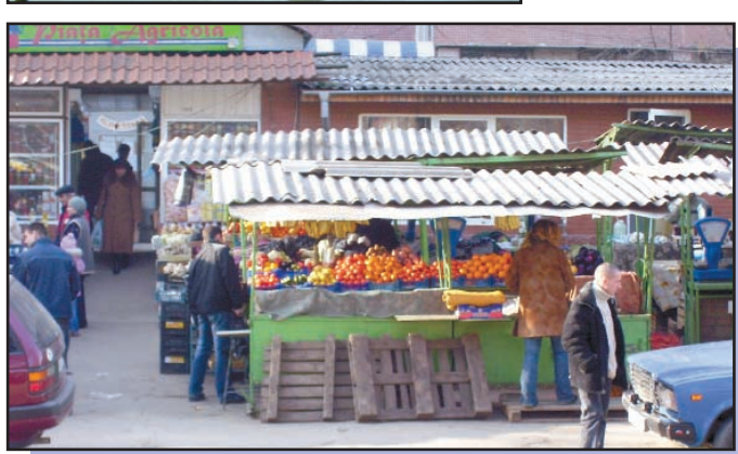
Outdoor market in the capital city of Moldova