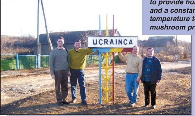
Remote city where we partnered with GMII on the Mushroom Project

FARMS International, Inc. • P.O. Box 270 • Knife River, MN 55609 • (218) 834-2676 • 1-888-99FARMS E-mail: info@farmsinternational.com • Website: www.farmsinternational.com