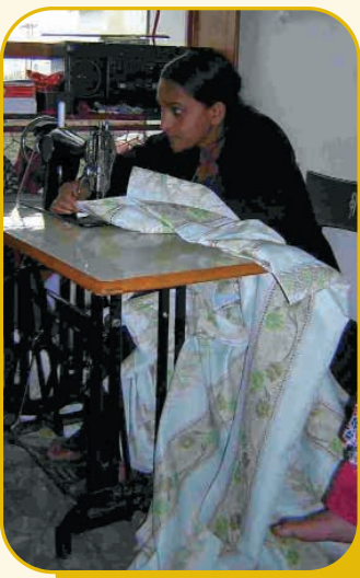
Tailor work, Nepal