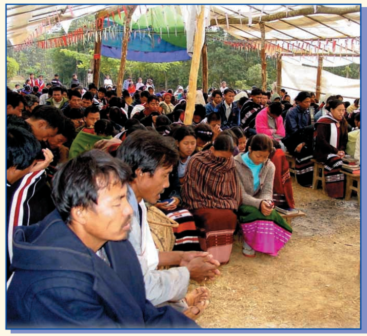
Nagas at prayer during day of prayer and fasting

church. FARMS will help make a strong church base for this. Truly, this is "Doing good that is good."