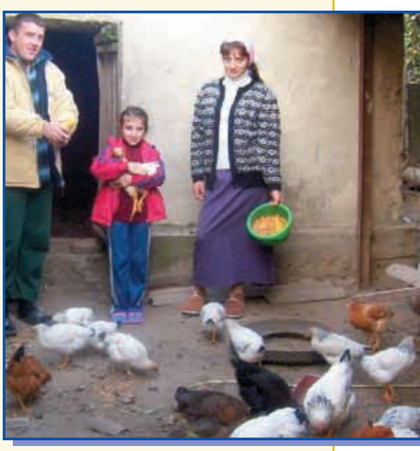
You can tell by their faces, the Ribca family loves their new poultry project. Pray that they succeed and grow the business as God blesses their faithfulness in Moldova.

• Moldova was our first program launched in Eastern Europe. The area FARMS is cur-