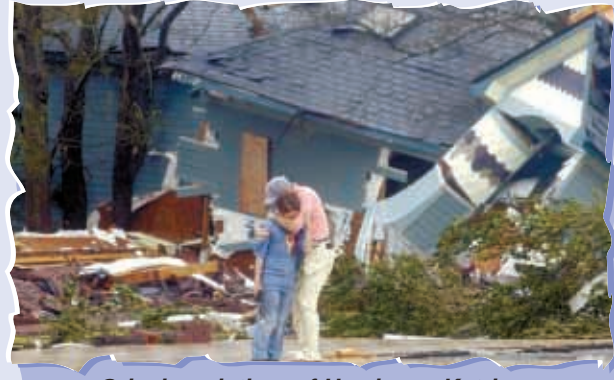
Grieving victims of Hurricane Katrina

The verse quoted from Romans is a tremendous comfort to all those who are in Christ, because we trust, we move forward in this world with confidence, joy, and peace. We