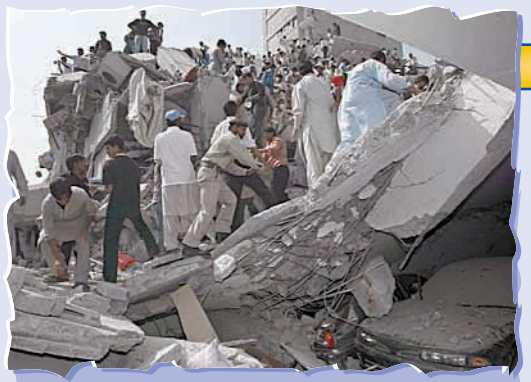
Earthquake in Kashmir, Pakistan