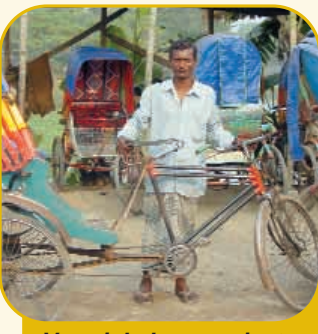
Van rickshaw project, Bangladesh