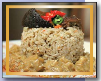
Meat and rice dish

Senegal: Christmas is about family in Senegal. A meat dish with rice is served. Juices are made from red roots (a category of plants with red roots) called Bissap. The drink is made from the leaves. You add