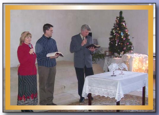
Christmas and The New Year are celebrated together!

Moldova: In Moldova, the Christmas and New Year celebrations are merged. The elements of the Christian faith are blended with hopes for a prosperous New Year. Carol singers arrive during the afternoon and evening of Christmas Eve. The well-wishers are expected during the afternoon of New Year's Evethese are groups who extend wishes for a happy life and prosperity in the coming year. The children, who symbolize purity and hope, receive apples, nuts, and home-baked bread. (Source: Moldova Foundation 2007)