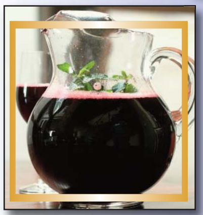
Juice made from Bissap

sugar and drink it cold. Fruit, chocolate, and cakes are a special treat for the kids. After dinner the adults sit around talking and drinking coffee and the children have hot chocolate.