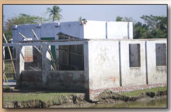
Business buildings are vacant