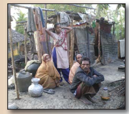
Families homes are in ruins

need is great in a nation where so many already have so little.