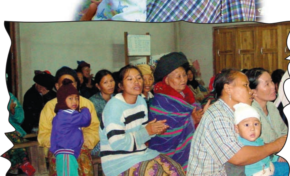
RMS loans help many Mien worship service

Recently it was suggested that the Mien form their own FARMS committee. This has now has been done, so do pray that the FARMS ministry to this dynamic Christian community grows and prospers.