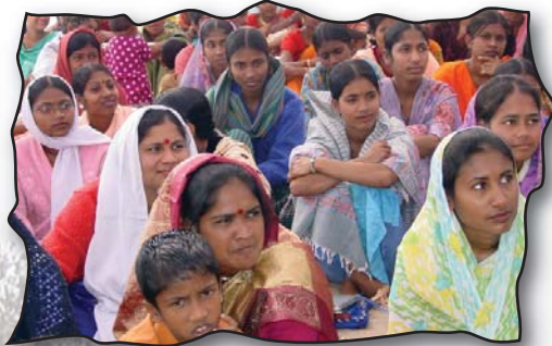
Churches are experiencing exciting growth

The people of the area are culturally Hindu, however there is a great openness to the Gospel. Hundreds of Bengalis have come to know the Lord Jesus. The ministry we were visiting had conducted an extensive and effective evangelism program for the prior six years. Several churches were established and dozens of Bible studies were on going. I was greatly impressed with the integrity of the ministry and the dedication of the “laborers”.