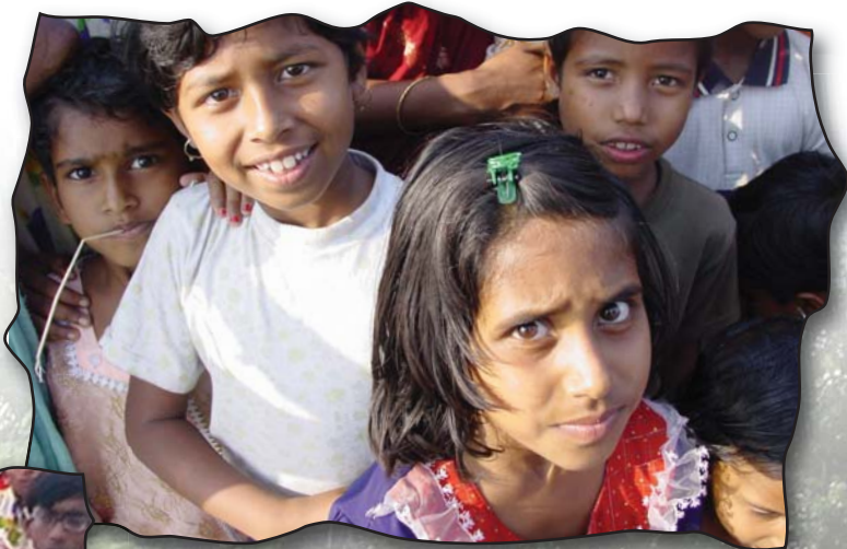
Children are the present and future of the church