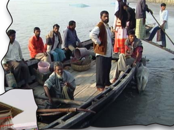
River travel is the main form of transportation in the delta