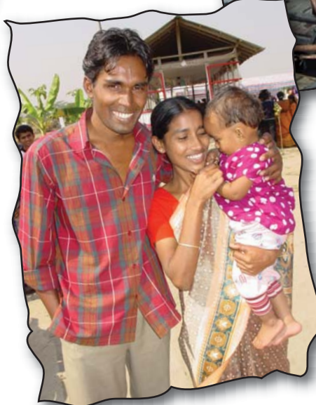
Bengali Christian family