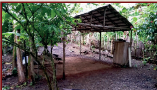
The present carpentry shop, that will be upgraded with a concrete floor and up to date tools.