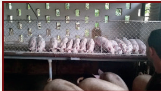
The committee president looks over the animals received for the service fee of FARMS loans. These animals will be raised and sold to fund the program and provide capital for new loans.