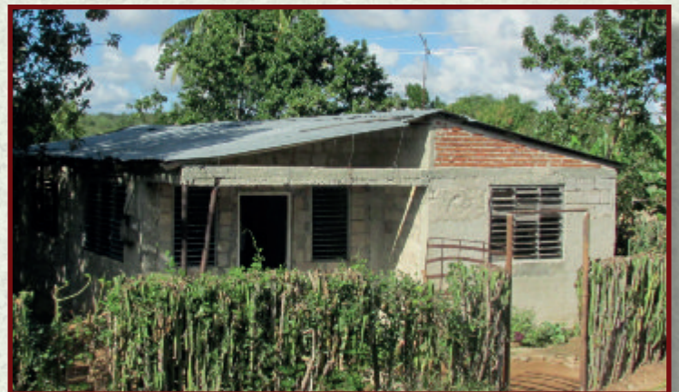
The "Good Samaritan Church" and training center

Please pray for the Good Samaritan Committee. Pray that they will sense God's encouragement and be successful.