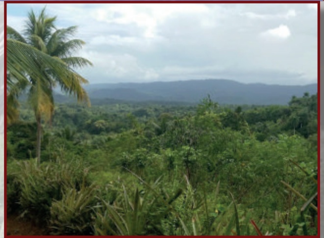
The hills and forests of the Baracoa region

The first project is a woodworking shop run by a pastor and a couple other men. The loan will be for a concrete floor and new carpentry tools. At present, the shop had only rudimentary tools, slowing production. This area has a good access to quality wood and the market is wide open for good furniture. Those that will be involved are excellent carpenters. This project will provide income for at least three families.