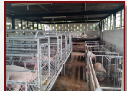
This is the hog rearing and breeding facility maintained by the committee