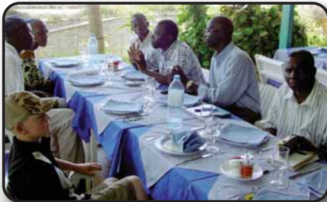
FARMS Senegal Committee breaking bread together

The FARMS program is apart of this effort by helping Christians have access to resources necessary to break out of poverty. In addition the believers are building the local church through their tithes and offerings. I hope you will enjoy some of the stories from our visit, and in our next newsletter I will elaborate on how the work being done in countries like Senegal is vital.