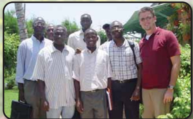
The FARMS Senegal Committee

FARMS International, Inc. • P.O. Box 270 • Knife River, MN 55609 • (218) 834-2676 • 1-888-99FARMS E-mail: info@farmsinternational.com • Website: www.farmsinternational.com