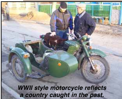
WWII style motorcycle reflects a country caught in the past.

use their own gifts and talents. We want to enable them to provide and be good stewards of God's blessings for their families and churches. This allows healthy growth in the family