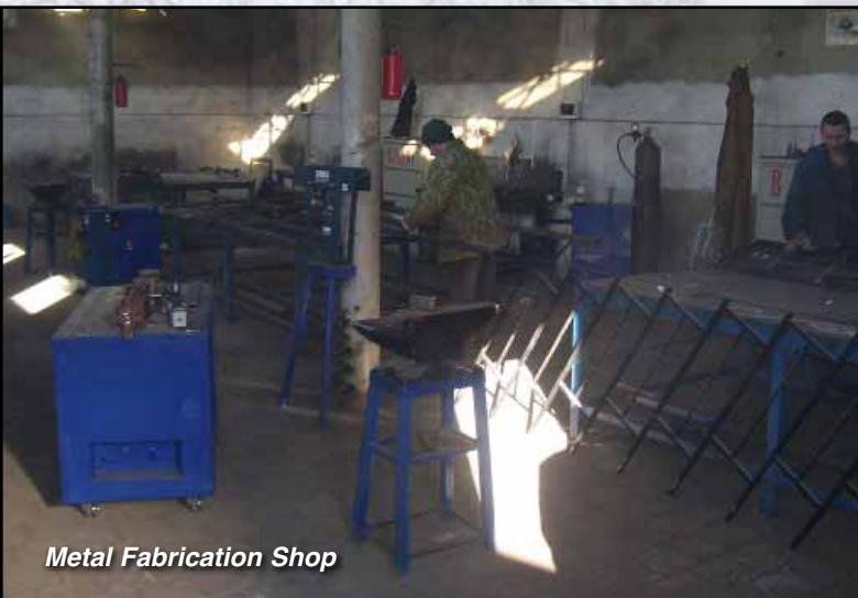
Metal Fabrication Shop