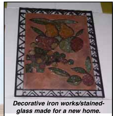
Decorative iron works/stained-glass made for a new home.

Entrepreneurialism has its foundation in the principles governing God's economy. A free flow of capital is needed for successful businesses. Deuteronomy is our starting point for the biblical principles of creating wealth. Scripture clearly teaches that use of money becomes a heart issue. Our values and faith in God are often reflected in how we use our money. The practice of