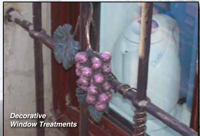
Decorative Window Treatments