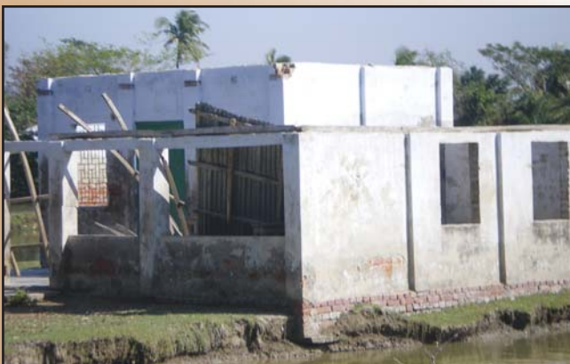
Business buildings are vacant