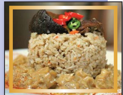
Meat and rice dish

Senegal: Christmas is about family in Senegal. A meat dish with rice is served. Juices are made from red roots (a category of plants with red roots) called Bissap. The drink is made from the leaves. You add