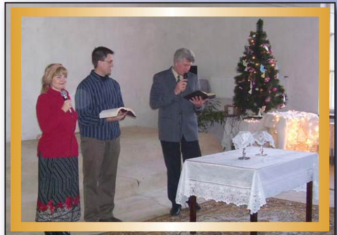
Christmas and The New Year are celebrated together!

Moldova: In Moldova, the Christmas and New Year celebrations are merged. The elements of the Christian faith are blended with hopes for a prosperous New Year. Carol singers arrive during the afternoon and evening of Christmas Eve. The well-wishers are expected during the afternoon of New Year's Eve-- these are groups who extend wishes for a happy life and prosperity in the coming year. The children, who symbolize purity and hope, receive apples, nuts, and home-baked bread. (Source: Moldova Foundation 2007)