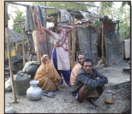
Families homes are in ruins

C YCLONE SIDR recently struck Bangladesh with devastating results. I am sure many of you have heard about it through the international news coverage. Many Bengalis in the western part of the nation were affected including some who are part of the FARMS program. Current estimates suggest as many as 10,000 lost their lives, and many villages were destroyed. Relief teams are still unable to get to some islands even to assess the damage. As you can imagine, the need is great in a nation where so many already have so little.